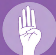
1. Palm to camera and tuck thumb