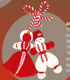
Martenitsa: They are a symbol of health, longevity, fertility and abundance. The main colors of "Martenitsa" are white and red. White is a symbol of purity, innocence and joy.