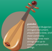
gadulka: A traditional Bulgarian stringed instrument, played with a bow, and most commonly featuring three main strings and up to sixteen sympathetic strings.

AFTER SCHOOL CLUB EVERY TUESDAY - HUB 3:10 PM - 4:00 PM