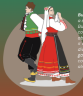
Bulgarian national garb: a symbolic part of Bulgarian culture. It conveys information about the person wearing it via embroidery of diverse symbols. The garbs are usually in bright colors, but black leather is also used.