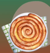
banista: a traditional pastry made in Bulgaria. Lucky charms are put into the pastry on certain occasions, particularly on New Year's Eve.