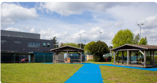
Year 7 Lunch Area (Grass Hut Area)