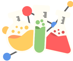
STEM - Science Club